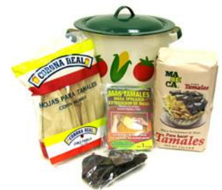
“Tamale Lovers Gift Pack”